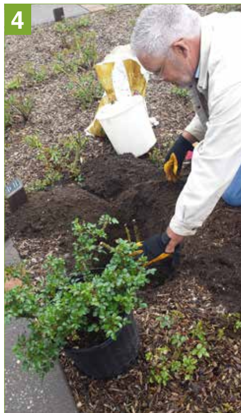
1. Overwintered rose pre-pruning; 2. Pruned and ready to plant; 3. Peter Bertrand demonstrates pruning a too-long root before planting; 4. Plant atop a mound of soil