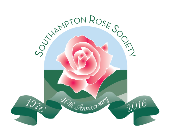
Beautifying Southampton Village for Over 40 years.

The SRS is part of the New York District of the ARS, which is the largest specialty plant society in the United States. Each member in good standing, is invited to participate in all national and district conventions and shows. We are proud to say, the SRS has the largest membership of all local Rose Societies in the United States.