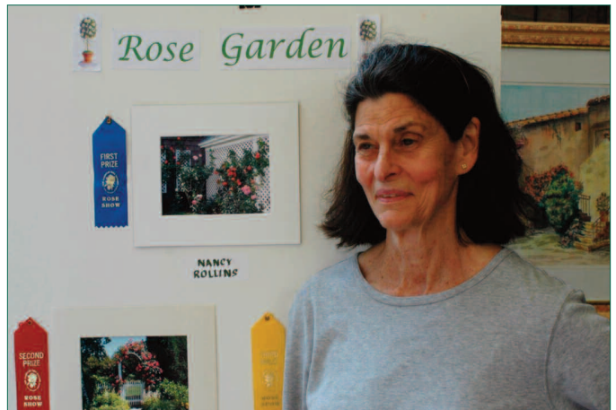
Nancy Rollins Photography Competition First Prize Winner

The complete list of Show Winners is to be found on page 5