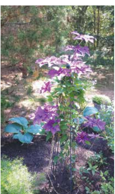
Clematis, an excellent rose companion, in the Berkrot-Staples garden.