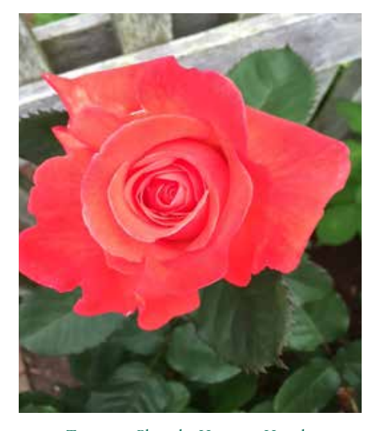
Tropicana.