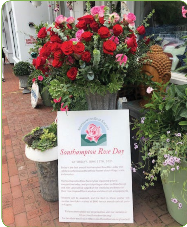
Southampton Rose Day

The first annual Southampton Rose Day, which was held on Saturday, June 12th, was a great success. The day was organized to recognize the rose as the official flower of Southampton Village and to share some joy and beauty in our village this month. Nearly a dozen storefronts on Main Street and Jobs Lane decorated their windows with various types of rose arrangements to celebrate the special occasion. Displays included traditional rose arrangements in vases, rose petal garlands hanging from the ceiling, and even a cart filled with roses and free rose bouquets for customers. The judges had a difficult time awarding first, second, and third place winners and a Best in Show winner. In the end, the following shops were recognized for participating in this event: