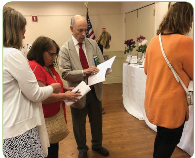
Rose Show judges at work