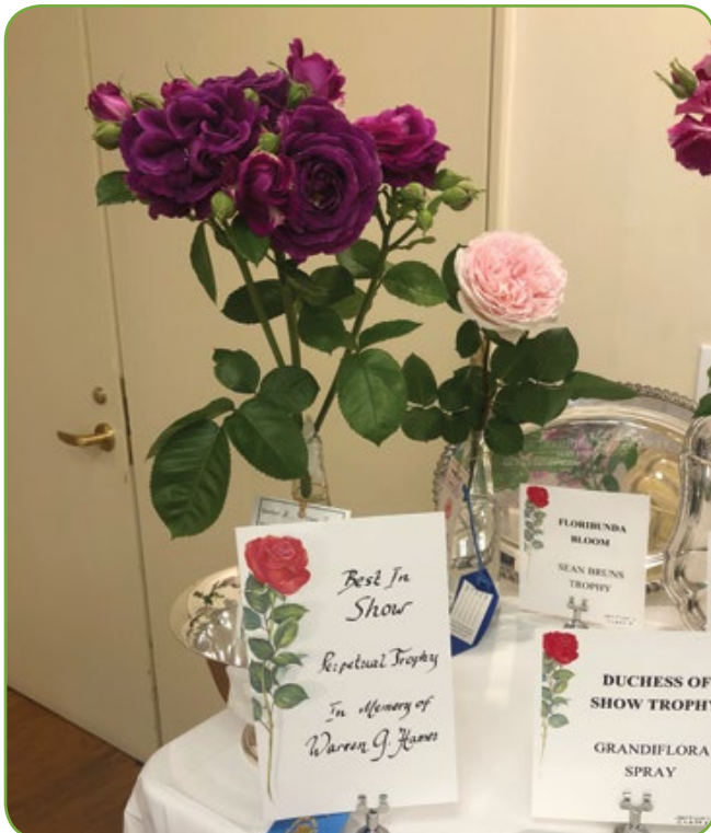
2021 Rose Show: Best in Show