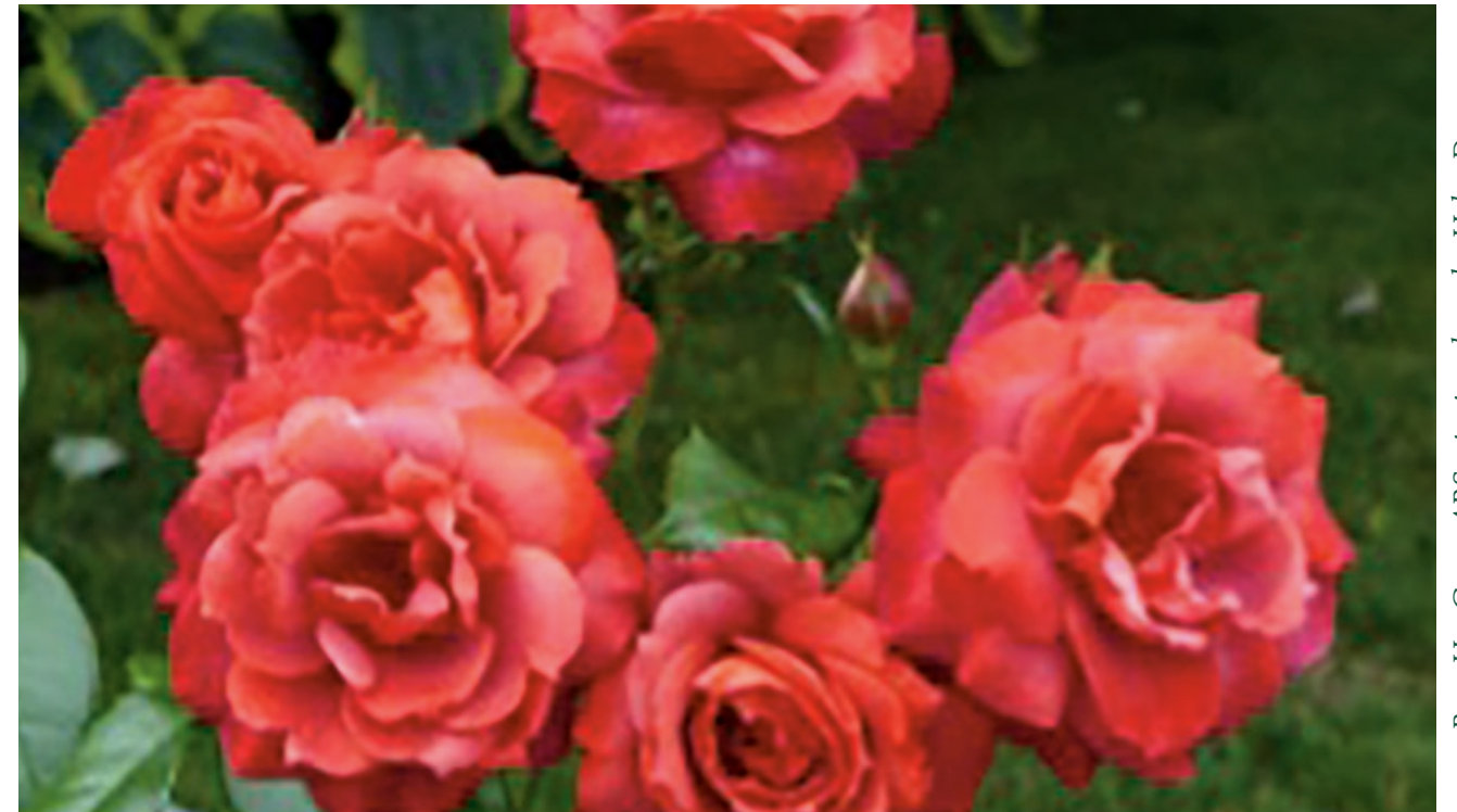
Rosa Hot Cocoa ARS winning

To access the linked video on YouTube, please visit this issue of Dune Rose at: