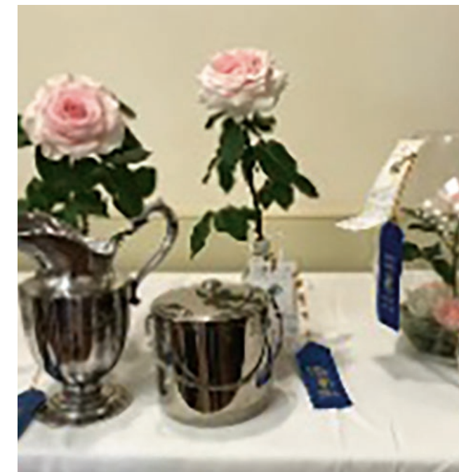
Some of Brad Bender's trophy winning roses

Sun, water, soil, insect and disease control. Keep a journal of what works for your garden to grow the best roses!