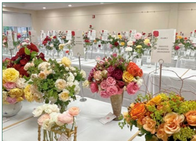
Past rose show tables

Long before SRS volunteers were deadheading in Southampton, New York schoolchildren were already campaigning for the rose as their emblem. They voted for it as early as 1890, but Albany took another 65 years to make it official in 1955, finally choosing a flower as comfortable on a Brooklyn stoop as on an Adirondack fencepost. The rose went on to become the emblem of both the state and New York City, a rare case of government getting its poetry exactly right and giving New Yorkers a symbol that is both classic and, like the state itself, undeniably tough.