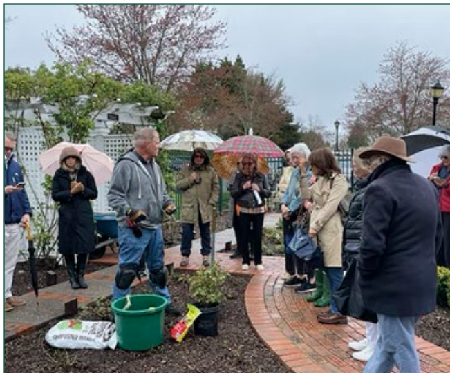
table organization, affiliated with the American Rose Society. Now in its 50th year as a local organization, the Southampton Rose Society has six public gardens in Southampton that are enjoyed by residents and visitors alike. All donations are tax-deductible, and all proceeds go towards maintaining our public gardens and community programs

For more information about the Southampton Rose Society, visit southamptonrose.org . 🌱